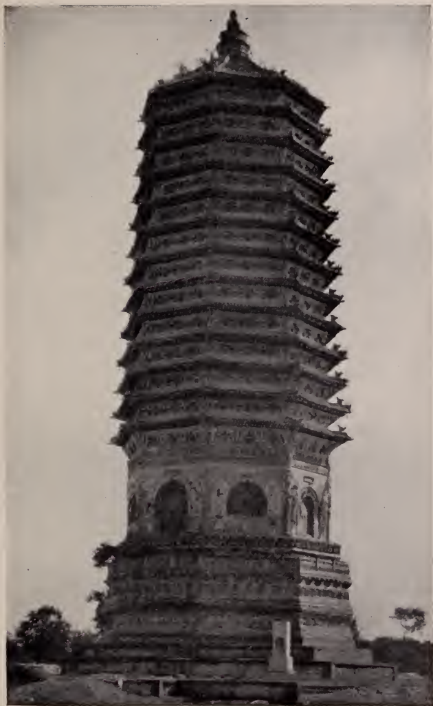
A PAGODA IN NORTHERN CHINA. About 120 feet high.